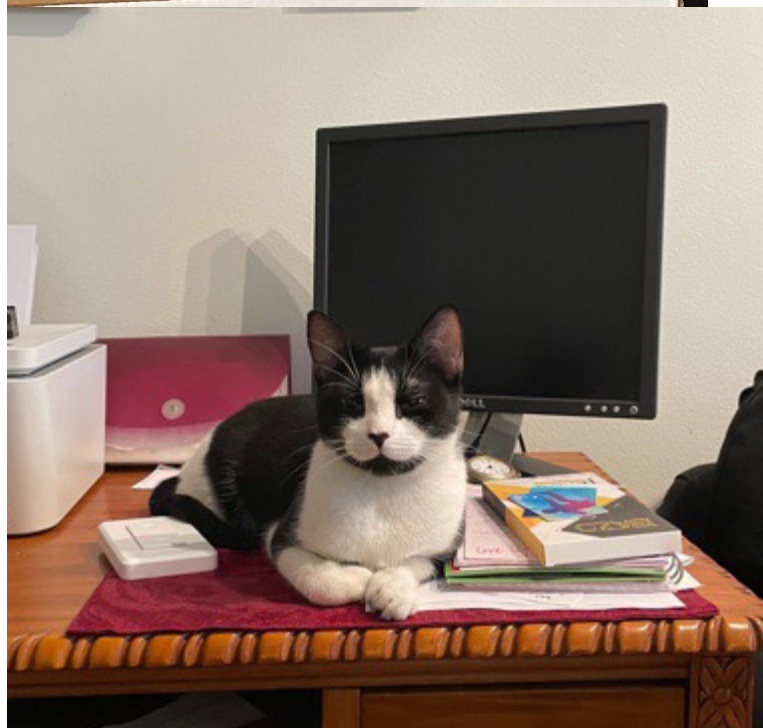
Clockwise from bottom left: Marzipan, Spago, and Hettie