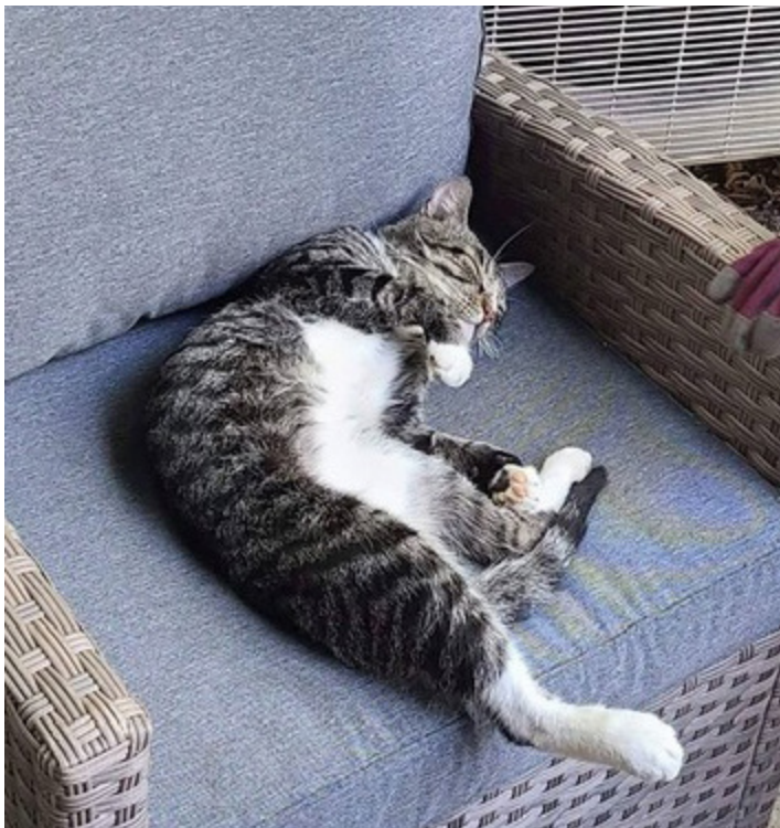
Kiwi keeping busy

(After 30 days, and 100 subscribers, KittyKind can get a custom URL.)