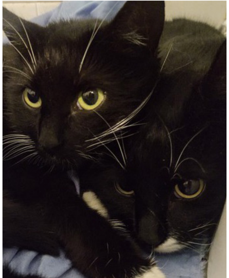
Kuma and Magpie are snuggling in their foster home